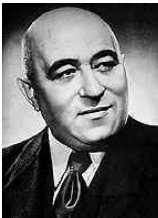
Imre Nagy addressing the Hungarian people on 28 th October 1956